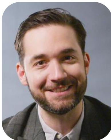
Alexis Ohanian Co-Founder of Reddit