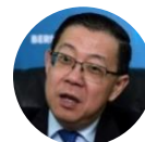
Lim Guan Eng Finance Minister, Malaysia