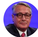
Wayne Swan Deputy Prime Minister and Treasurer, Australia