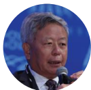
Jin Liqun Asian Infrastructure Investment Bank