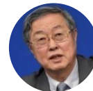
Zhou Xiaochuan The People's Bank of China