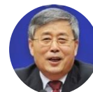
Guo Shuqing China Securities Regulatory Commission