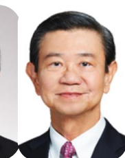
Wong Kan Seng Chairman, United Overseas Bank Limited