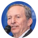
Lawrence H. Summers Former US Secretary of the Treasury