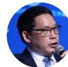
Uttama Savanayana Finance Minister, Thailand