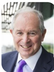
Stephen A. Schwarzman Chairman, CEO and Co-Founder, The Blackstone Group L.P.