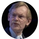
Robert Zoellick The World Bank Group