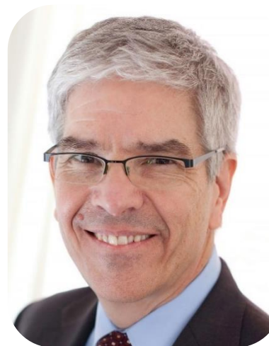
Paul Romer 2018 Nobel Laureate for Economic Sciences