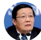
Lou Jiwei China Investment Corporation