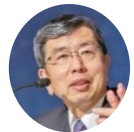
Takehiko Nakao Asian Development Bank