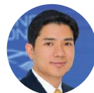
Robin Li Founder, Chairman and CEO, Baidu