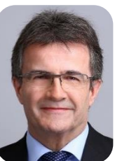
Philippe Brassac Chief Executive Officer, Crédit Agricole S.A.