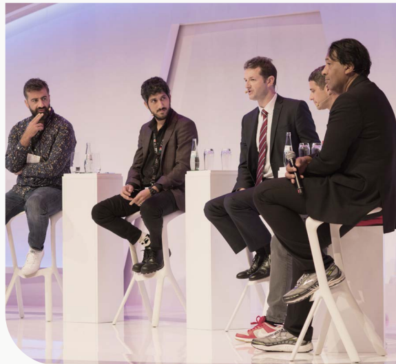
ELEVATOR PITCH ZONE