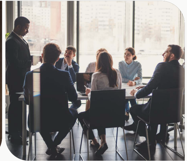
BUSINESS MATCHMAKING ZONE